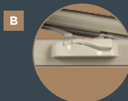
B Folding/nested operator handle